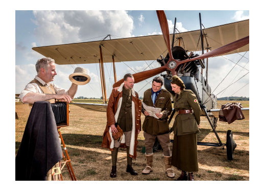
Wing Commander £25.00 pp