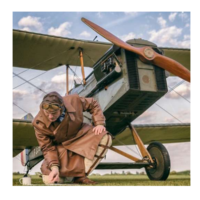
Squadron Leader £19.50 pp

2pm: Free time to visit the shop before you leave, picking up those special souvenirs.